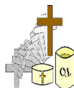
Sacrament of Anointing

On November 11 at the 10:30 Mass, we invite all of our parishioners who would like to receive the anointing of the sick to come to Mass that day. We will have the anointing during Mass and afterward everyone is invited to a luncheon in your honor in the gym. Please come and enjoy each other's company.