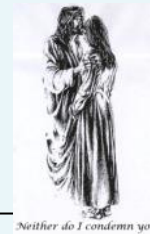
Neither do I condemn you

www.ccsww.org/projectrachel You are loved with an everlasting Love!