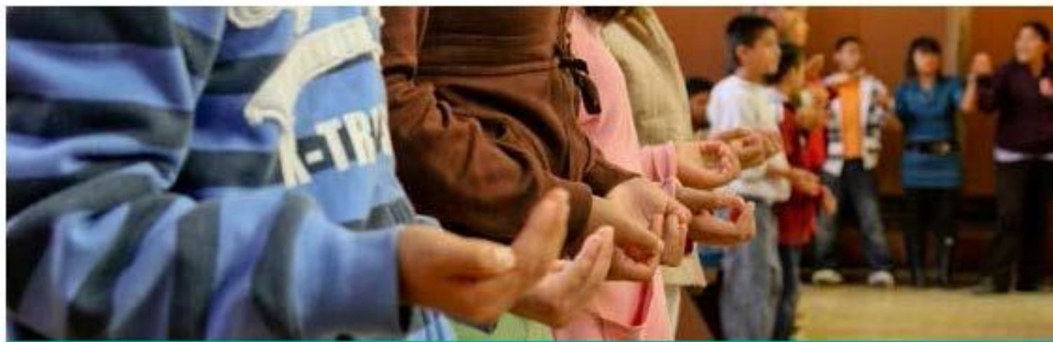
Parishioners pray at a church next to Casa del Migrante in San Juan Diego, Mexico. Casa del Migrante has safehouses for migrants throughout the Northern Triangle.