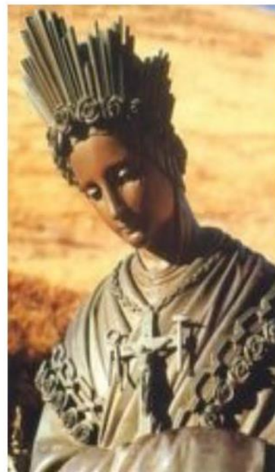
LASALLETTE, FRANCE "How long I have suffered for you."

St. Marguerite Marie Alacoque, a Visitation nun, was visited by Jesus in 1674 with the request to establish devotion to His Sacred Heart. Do you know the 12 promises our Lord made to St. Marguerite for those who prayed fervently to His Sacred Heart?